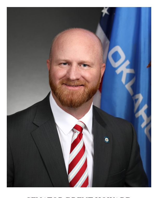
SENATOR BRENT HOWARD