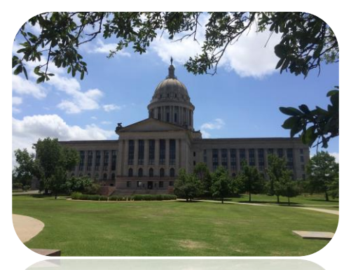
DEADLINE WEEK MOVES SEVERAL BILLS

201 N.E. 23rd Street OKC, OK 73105 Phone: 1-800-324-6651 / 405-528-7515 Fax: 405-528-7560 Email: jlewis@oml.org Internet: www.oml.org